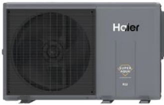
AW052MUCHA AW072MUCHA AW092MUCHA